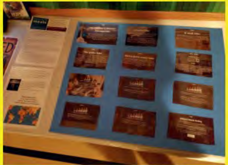
Statistics for countries Mary's Meals schools are in.