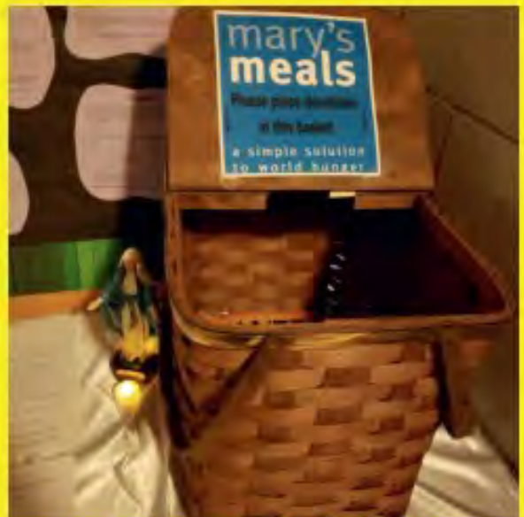
Collection basket for donation envelopes.