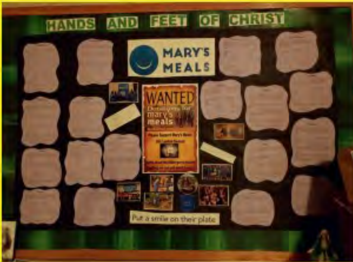
Display of countries Mary's Meals has schools in.