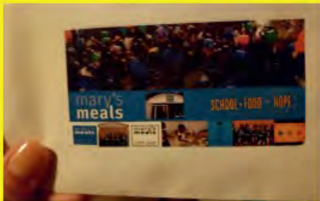
Envelopes to place donations to Mary's Meal in.