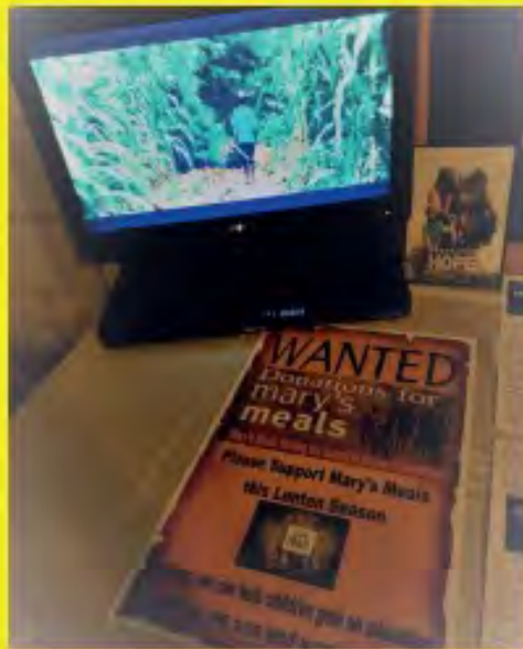
Wanted: Your Donations for Mary's Meals flier and slide show with pictures from various schools sponsored by Mary's Meals.